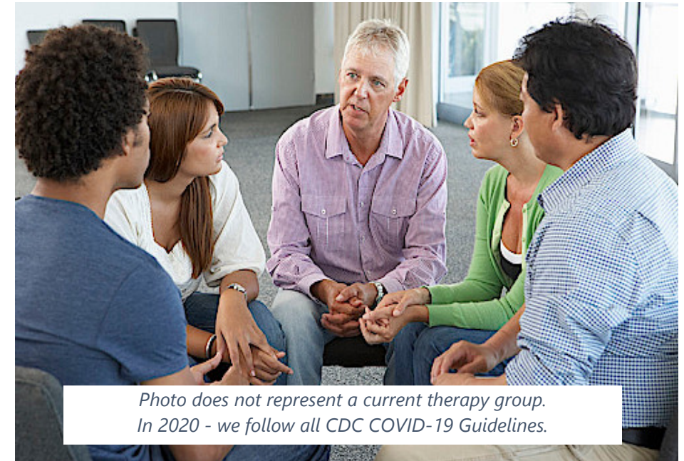
Photo does not represent a current therapy group. In 2020 - we follow all CDC COVID-19 Guidelines.

Our addiction recovery philosophy uses an integrative, whole person approach to addiction treatment, including dual diagnosis. Our holistic therapies include mindfulness , yoga, tai chi and cognitive behavioral therapy. Our goal is to assist our clients in bringing their lives – body, mind and spirit – into a state of balance and wellness .